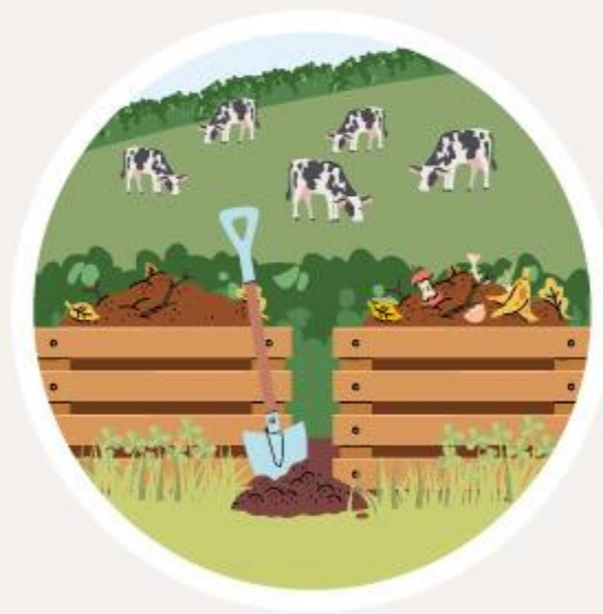
Applying manure and composts