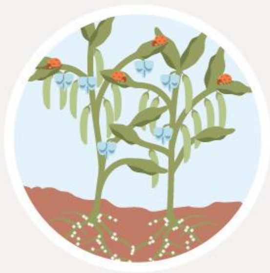
Growing nitrogen fixing legumes