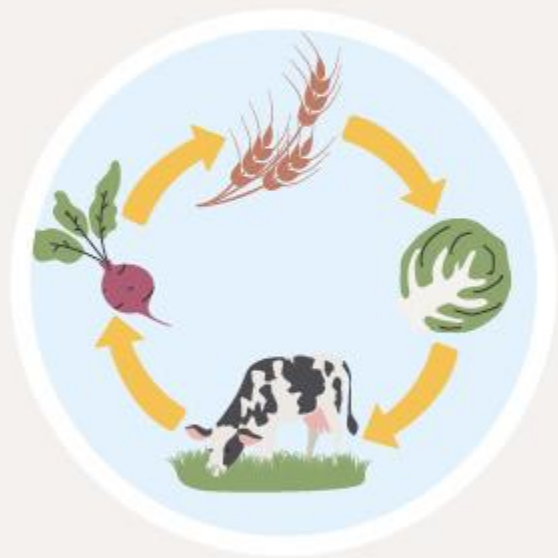
Long and diverse crop rotations

Organic farmers use a range of regenerative practices to build soil fertility without relying on artificial fertilisers. Studies show that, on average, soil on organic farms store more carbon [1] and have higher levels of soil microorganisms [2]