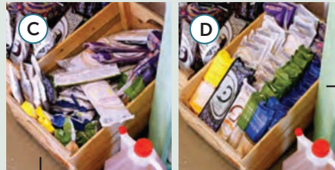
*Image “C” - Disorganised noodle packets give a ‘bargain bin’ impression, decreasing product value, and reducing awareness of product range