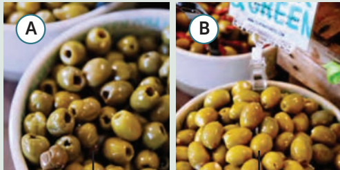
* Image “A”: Unappealing shrunken olives need to be removed and olives rotated to retain freshness

Images A and B below give different impressions of the overall shop – A might indicate the olives have low sales turnover, and that staff are not vigilant in checking stock for freshness – B gives the opposite impression.