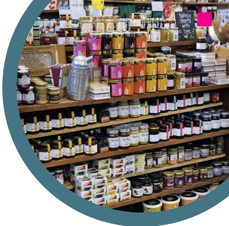
Breakfast condiments all together and near fresh bread