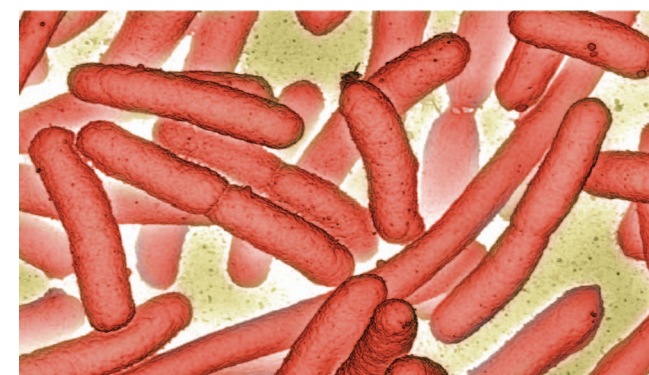
Certain E.coli bacteria can produce ESBLs, enzymes that make them resistant to a whole class of antibiotics.

The Alliance is not calling for a total withdrawal of all antibiotic treatment of animals. On the contrary, we believe it is vital to maintain the effectiveness of antibiotics for treating actual sick animals, so reducing suffering and maintaining good welfare.